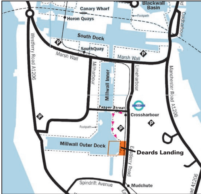
➡ - - - ➡ Waterside public footpath

Deards Landing, Millwall Outer Dock, Isle of Dogs E14